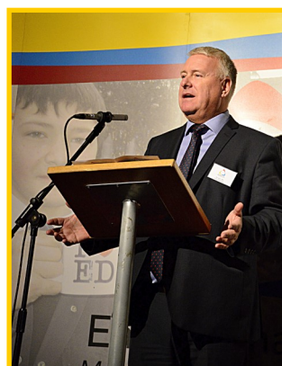
Ian Lavery MP and Chair of UK Labour Party