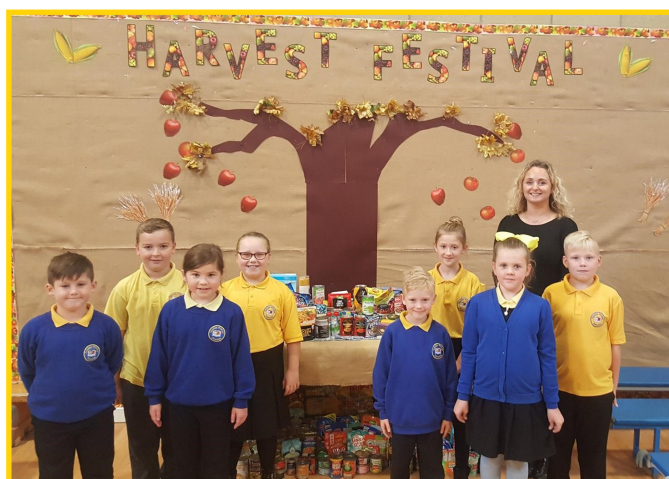
Seaview Primary School and their kind donation.