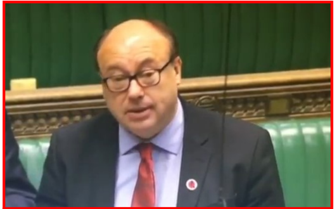
Grahame Morris MP in House of Commons 19th October

Thanks to support from our local MP Grahame Morris the Trust has been held up as an example of good practice in Parliament. On Wednesday 18th October the Trust was cited by the opposition as having to fight the consequences of the Universal Credit roll-out and the following day Grahame championed the cause of the People's Takeaway (see below)—challenging the Minister to explain why such initiatives are necessary.