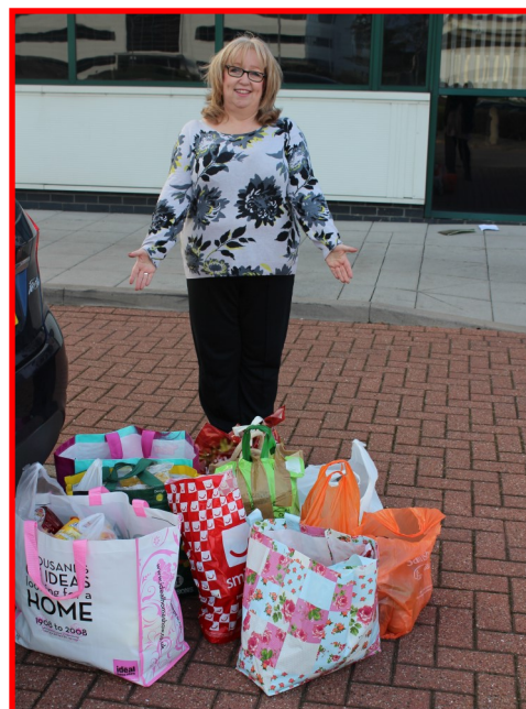
GT Group's kind donation of food

Want to make a donation? Visit the FEED page on our website ( www.eastdurhamtrust.org.uk ) to see all the local donation points, drop food into our office on Yoden Road or alternatively donate to our new appeal, the People's Takeaway (more info on Page 2).