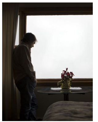
*Name has been changed to protect the identity of the individual