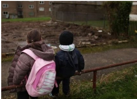
*Name has been changed to protect the identity of the individual