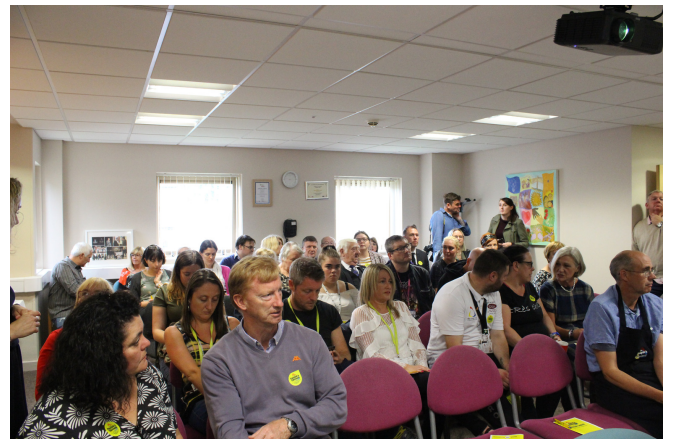
Representatives from Comic Relief, Big Lottery Fund and County Durham Community Foundation attended the launch